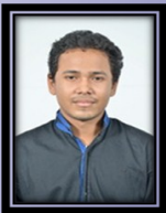
Mr. Hanif Mohamad